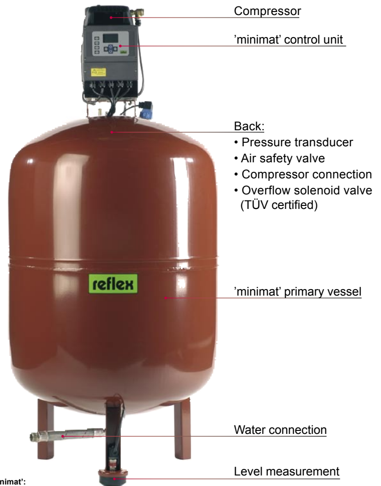
reflex 'minimat': The elastic pressure maintenance within very confined limits (+/- 0.1 bar)

'minimat' - comfortable compressor pressure-maintenance in a compact design